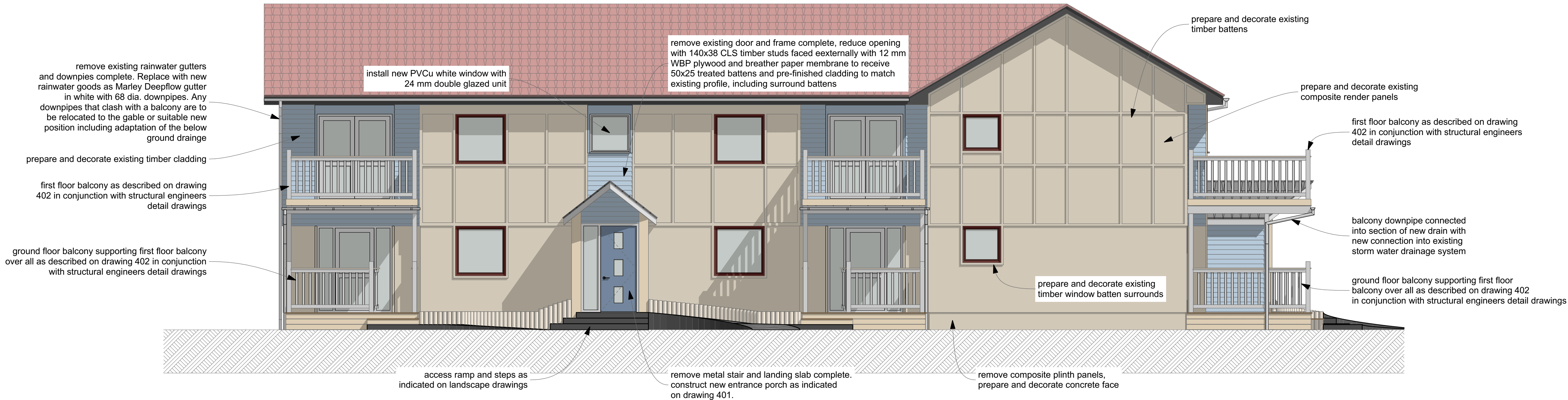
Unit D4 East Elevation