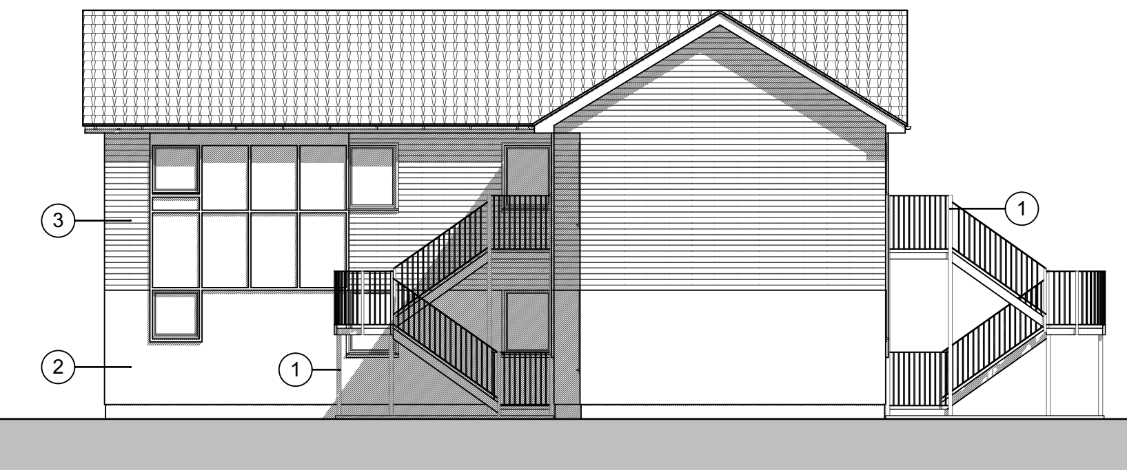
C5-B South Elevation 1:100